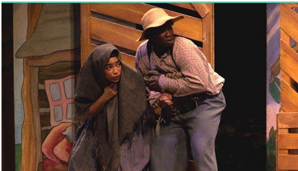
Harriet Tubman and the Underground Railroad

What makes a play outstanding? An example would most defiantly be a play titled Harriet Tubman and the Underground Railroad , which was performed at the Bushnell. The stage set-up itself was perfection. The usage of minimal props showcased the imagination and creativity used throughout the entire play. On the other hand, the sudden flourish were delightful yet, poorly timed.